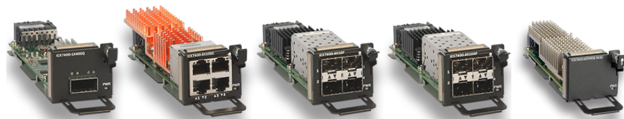
Figure 3: Five different optional port modules are offered for the Ruckus ICX 7450 with a choice of 1 GbE SFP, 10 GbE SFP/SFP+, 10GBASE-T, and 40 GbE QSFP+ options and an IPsec VPN service module.