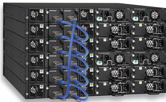
Figure 1: Up to 12 Ruckus ICX 7450 switches can be stacked together using two full-duplex QSFP+ 40 Gbps ports that provide a fully redundant backplane with 960 Gbps of stacking bandwidth.

Deployed as a standalone switch, a stack, or a network fabric, organizations reap the benefits of a flexible platform and the assurance that their investments are protected.